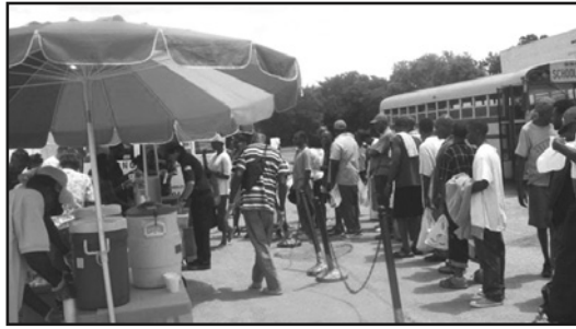
Council's Outreach Team doing HIV testing at Dallas International Church