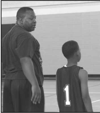
Sharing prevention messages through basketball camps