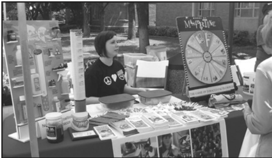
World No Tobacco Day Event