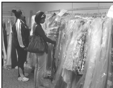
Students searching for the perfect prom dress.

Buying a dress, renting a tuxedo, planning photo opportunities, and making dinner plans are activities that go along with attending prom. This is a big event in the lives of many young men and women. Youth often view proms as their entrance into “adult” behavior. Drinking and other drug use can be prevalent and occur before, during, and after proms. Also coupled with young and inexperienced drivers getting into cars, alcohol and other drug use increase the likelihood of sexual activity, victimization, and crime.