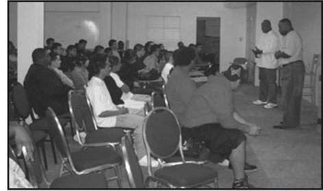
Working with participating boys at the BuzzFree PROMises Dress & Tuxedo Giveaway