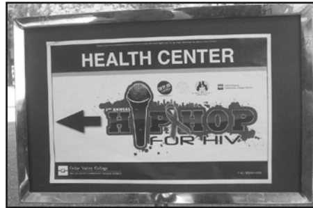
A collaborative event with 97.9 The Beat