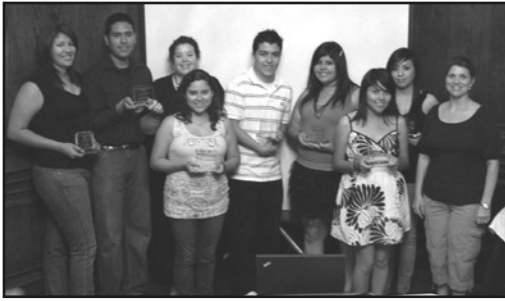
Thomas Jefferson High School Social Norms Street Team Awards Luncheon