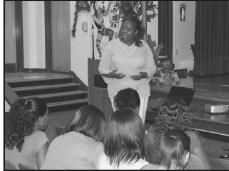
Presentation on consequences associated with drug use and unprotected sex at H.S. Thompson Learning Center